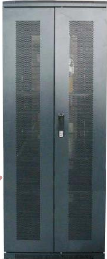
Rare Split door Panel