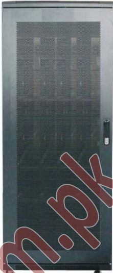
Front Mesh Panel