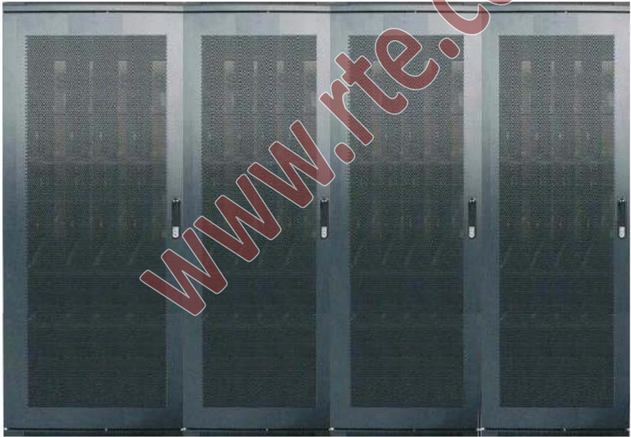
800 x 1000 600 x 1000 600 x 1000 600 x 1000 TELMAN 4+Rack Panel: ISP and Data Center Solution