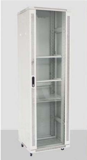
Front Tempered Glass Door