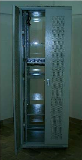
Rare Split Mesh Panel